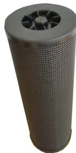
Carbon filter cartridge

There are therefore no open cuts, which makes for excellent corrosion protection.